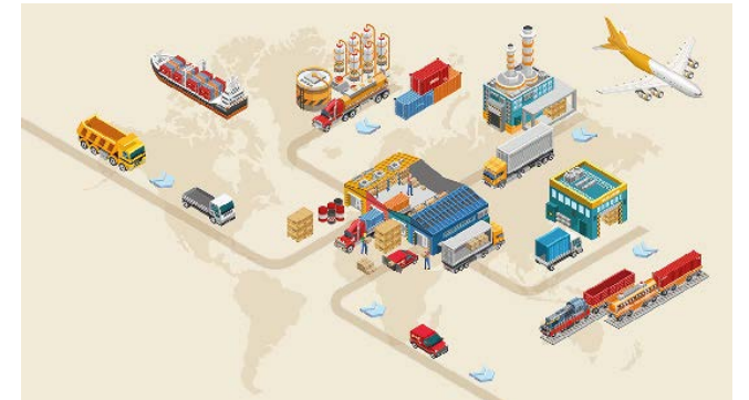
Nuclear Energy Supply Chain

Advanced nuclear energy companies are completing development activities for new nuclear reactors and beginning construction and deployment in the United States and Canada. While there is significant overlap in the needs of advanced and conventional nuclear reactors, each advanced reactor will require new supply chains. Some advanced nuclear power plants will have similar power conversion systems but others will require new structures, systems, and components that differ from existing large light water reactors. Clear understanding of the design and the future supply chains for different advanced reactor companies enable more effective engagement and investment in advanced nuclear energy.